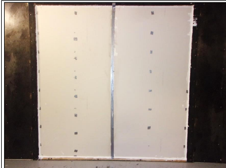
Photo No. 1 Receive Room View of test Specimen