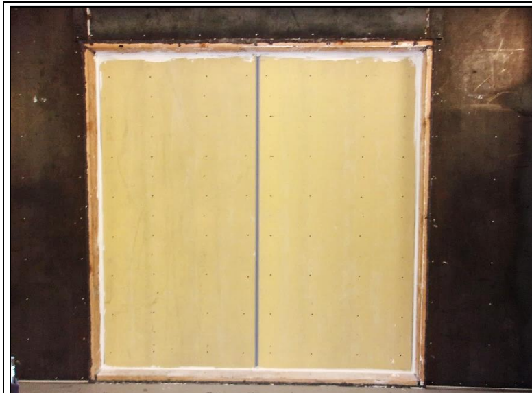
Photo No. 2 Source Room View of Test Specimen